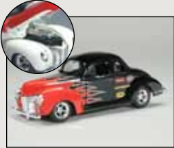
1940 Ford Coupe opening doors, trunk & hood