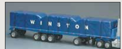
Tarp Load Trailer with Multi-Axle Trailer