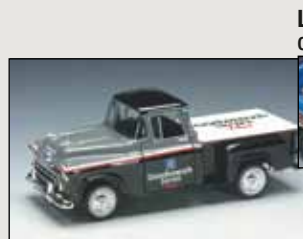
1957 Chevy Stepside Pickup opening doors, hood & sliding tonneau cover