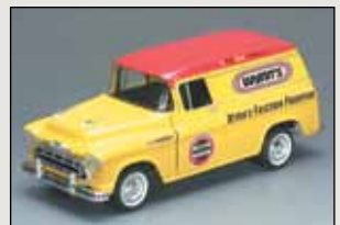
1957 Chevy Panel opening doors, rear doors & hood

Call us at 1-800-844-8067 ext.252 for a free quote!