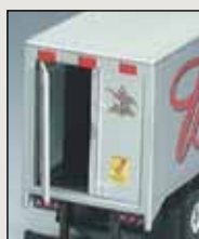
opening double doors