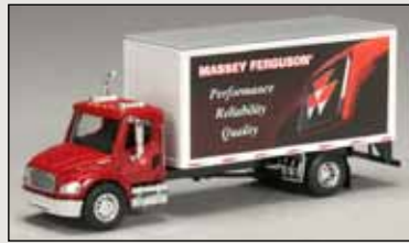
City Delivery Van Box