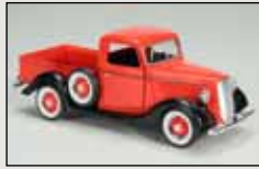
16160 Red/Black 1937 Ford Pickup