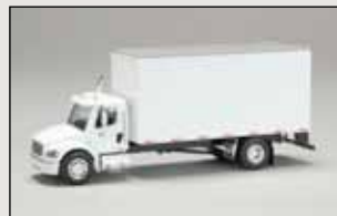
35501 White Freightliner M2 with Van Box