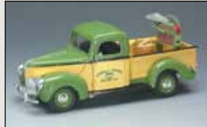
1940 Ford Pickup opening doors & hood