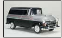
78215 Black 1957 Chevy Panel Bank