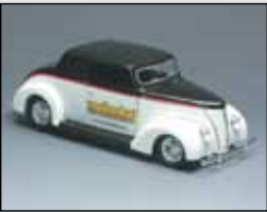
1937 Ford Cabriolet opening doors, trunk & hood