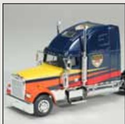
Freightliner Classic XL