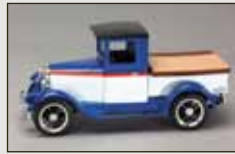
18019TV Red/White/Blue 1928 Chevy Pickup