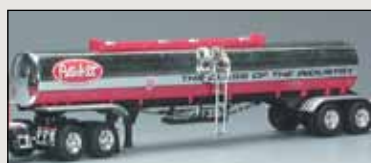
Round Fuel Tanker