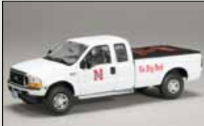
Ford F-250 and F-350 Tonneau Cover