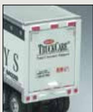
opening single door