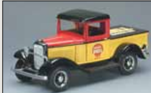
1932 Ford Pickup opening doors, butterfly hood & sliding tonneau cover