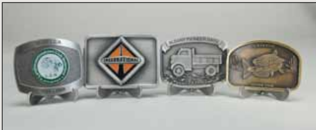
Pewter Belt Buckles color fill • antique copper • antique brass