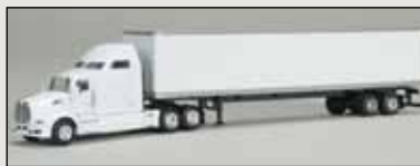
37012 White Kenworth T660 and 53' Trailer with Single Rear Door