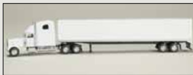
36610 White Freightliner Classic XL and 53' Trailer with Single Rear Door