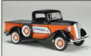
1937 Ford Pickup opening doors & sliding tonneau cover