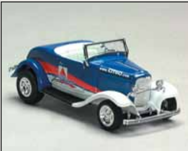
1932 Ford Roadster opening doors, trunk & butterfly hood