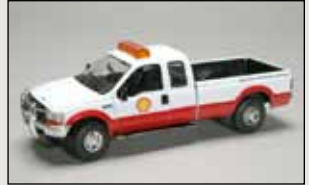
Ford F-250 and F-350 Light Bar and Grille Guard