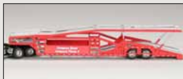
Car Transporter Trailer removable sign board option