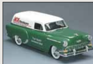
1954 Chevy Sedan opening doors, rear door & hood