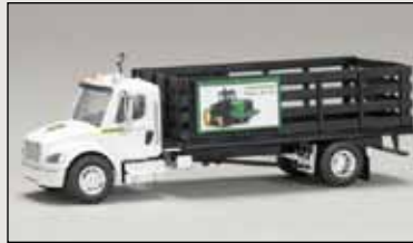
Stakebody removable signboard option