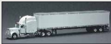
32858 White Peterbilt 379 and 53' Trailer with Single Rear Door