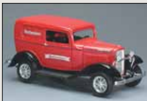
1932 Ford Sedan Delivery opening doors, rear doors & butterfly hood