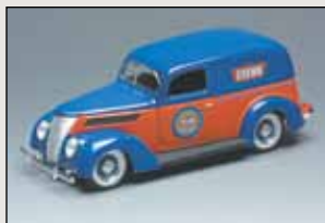
1937 Ford Panel opening doors, rear doors & hood