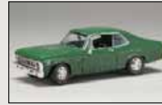
71004 Green 1972 Chevy Nova SS