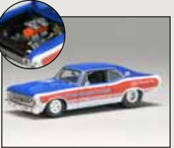
1970 Chevy Nova Pro Street Version opening doors, trunk & hood; detailed high-performance engine