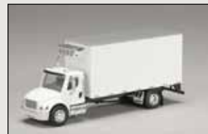
35516 White Freightliner M2 with Van Box and Reefer Unit