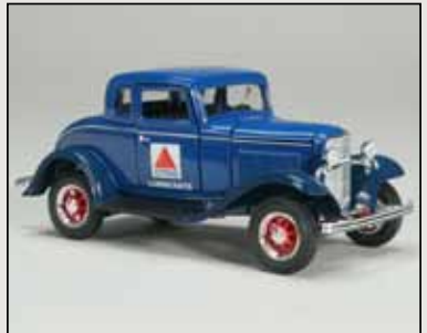
1932 Ford Coupe opening doors, trunk & butterfly hood