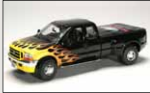
Ford F-350 Dually