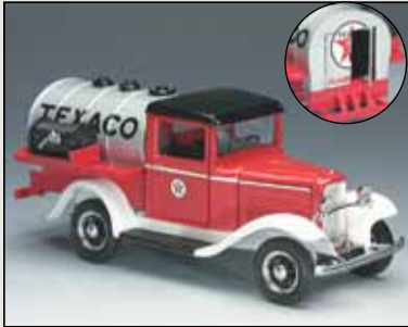
1932 Ford Tanker opening doors, rear doors & butterfly hood