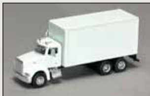
33100 White Peterbilt 385 with Van Box and White Top