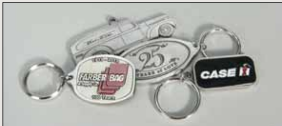
Pewter Keytags color fill • antique brass