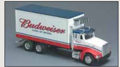
Van Box with Refrigeration Unit