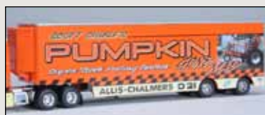
Dropped Trailer with Spread Axle