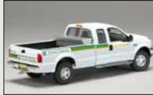
Ford F-250 and F-350 Full Size Toolbox