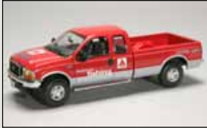
Ford F-250 and F-350 Standard Body