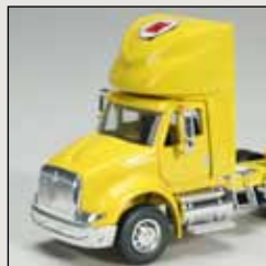
International 8600 with Airfoil