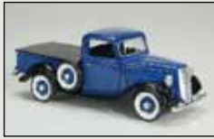
16153 Blue/Black 1937 Ford Pickup Bank with Tonneau Cover