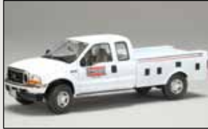
Ford F-250 and F-350 Service Body