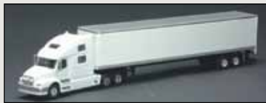
31500 White Volvo 770 and 53' Trailer with Double Rear Door