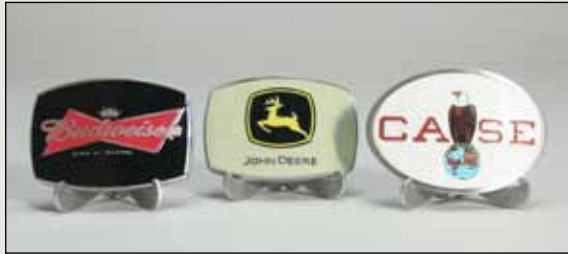
Color Fill Belt Buckles

CUSTOM DESIGNS - SEND US YOUR ARTWORK FOR A FREE QUOTE & CONCEPT DRAWING