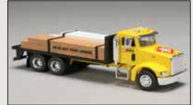
Construction Supply Load