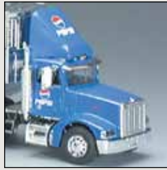
Peterbilt 385 with Airfoil