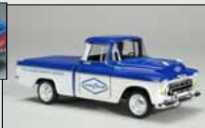
1957 Chevy Cameo Pickup opening doors & hood