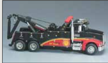
Wrecker movable boom