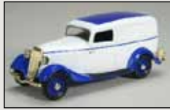
14031 White/Blue 1934 Ford Sedan Delivery

Features include opening doors and detailed interiors, high gloss baked enamel finish.