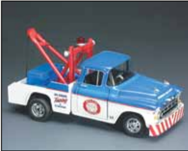
1957 Chevy Wrecker opening doors, toolbox & hood