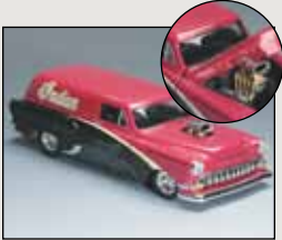
1954 Chevy Sedan Street Rod opening doors, trunk & hood