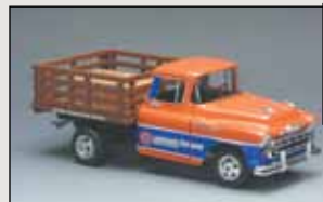
1957 Chevy Stakebed opening doors & hood