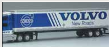
53' Van Trailer