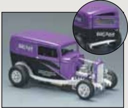
1932 Ford Sedan Street Rod opening doors, rear door & exposed engine