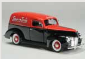
1940 Ford Panel opening doors, rear door & hood