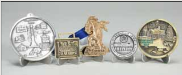
Pewter Medallions, Coins & Watch Fob Tags color fill • antique copper • antique brass • Coins (3/4" to 1 1/2")

BELT BUCKLES - COINS - KEYTAGS - MEDALLIONS