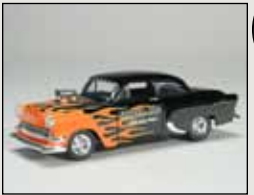
1954 Chevy Coupe Street Machine opening doors, trunk & hood